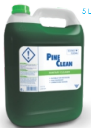
PINE CLEAN Sanitary Cleaner