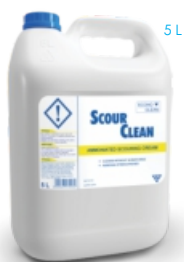
SCOUR CLEAN Ammoniated Scouring Cream