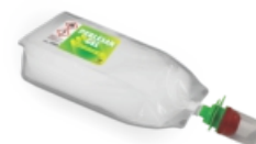
PERLE SAN HAND SANITISER SACHET REFILLS Perle San Gel 800ml - Manual