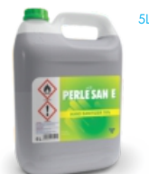
PERLE® SAN E Liquid Hand Sanitizer