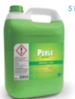
PERLE® Personal Soap Aloe Vera Fragrance