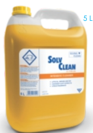
SOLV CLEAN CITRUS Intensive Cleaner