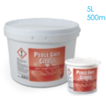
PERLE® GRIT Grit Hand Cleaner