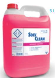
SOLV CLEAN FRESH Intensive Cleaner