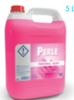
PERLE® PINK Personal Soap