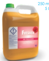
FRESHER Citrus Air Freshener