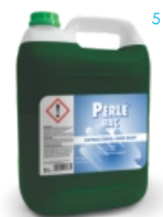
PERLE® BAC Antibacterial Hand Soap Green