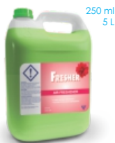
FRESHER Green Dawn Air Freshener