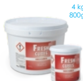
FRESH CUBES Deodorising Solid Cubes