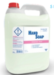
HAND SOAP WHITE Personal Soap