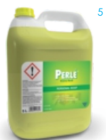
PERLE® Personal Soap Honey Bush Fragrance