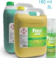
PERLE® FOAM Foam Personal Soap Aloe Vera/ Honey Bush Fragrance