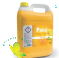
PERLE® Bio-Citrus Personal Soap (Bio-Citrus)