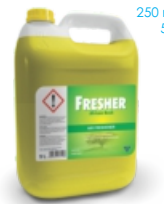
FRESHER African Bush Air Freshener