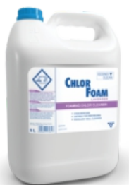
CHLOR FOAM LAVENDER Foaming Chlor Cleaner