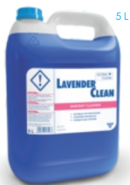
LAVENDER CLEAN Sanitary Cleaner