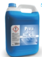
PERLE® BAC Antibacterial Hand Soap Blue