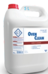
OVEN CLEAN Oven Cleaner