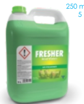
FRESHER Desert Flowers Air Freshener