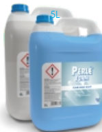
PERLE® FOAM Foam Personal Soap Clear & Blue