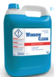
WINDOW CLEAN Window Cleaner