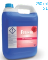
FRESHER Lavender Air Freshener