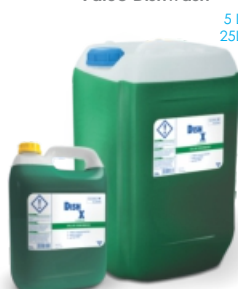
DISH X LEMON Value Dishwash