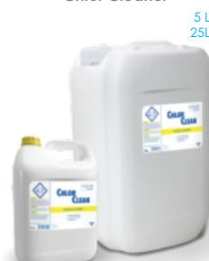
CHLOR CLEAN Chlor Cleaner