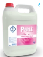
PERLE® WHITE Personal Soap