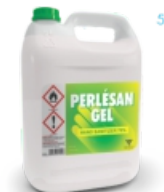
PERLE® SAN GEL Gel Hand Sanitizer