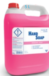
HAND SOAP PINK Personal Soap