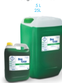
DISH CLEAN LEMON Budget Dishwash