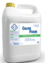
CHLOR FOAM LEMON Foaming Chlor Cleaner