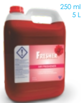
FRESHER Cherry Air Freshener