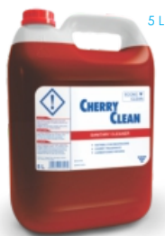
CHERRY CLEAN Sanitary Cleaner